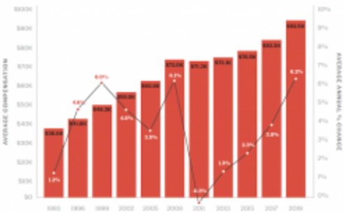
Architect compensation gains match strongest level of past two decades Average compensation, including overtime, bonuses, and incentive compensation, for staff architecture positions of US architecture firms